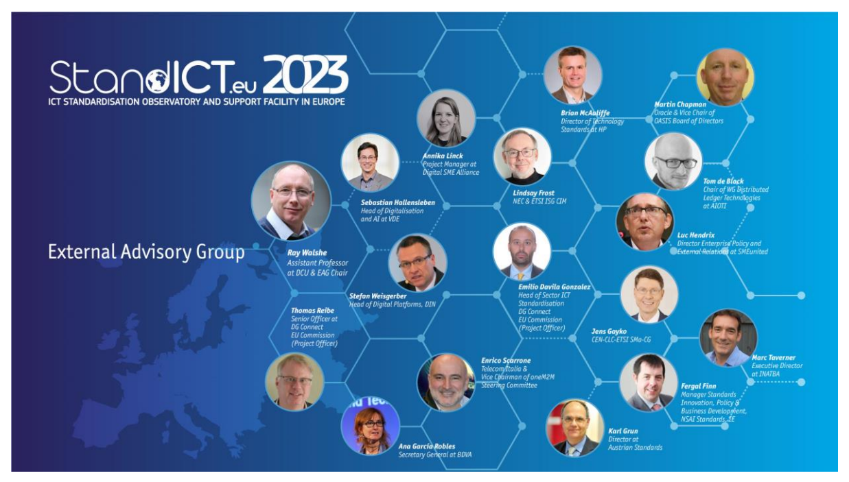
Figure 2 StandICT.eu 2023 EAG

The EAG is composed of 17 renowned experts from all the ICT standardisation areas. The EAG presides over the most pertinent DSM perspectives covering SDOs and their developments. Figure 1 identifies the EAG members. Each EAG member works probono and bound by a standard Terms of Reference (ToR) document. The members of the EAG lend both experience and influence to maintaining momentum and strengthening the impact of the Group. Members are recognised ICT standardisation specialists who regularly meet remotely to review topics of the open call. The EAG provides a pivotal link to the current status of EU priority areas for ICT standards development, coordinate a number of ICT Landscape Assessments and undertake a corresponding Standards Gap Analysis based on the resulting reports. At the time of writing the EUOS EAG are undertaking landscape assessments related to Big Data, Artificial Intelligence, Digitising European Landscape, Data Discovery and Standards Education.