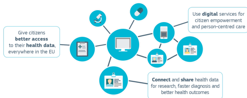
Figure 1: EU Strategy for Digital Transformation in Cross-Border Healthcare: eHealth 2018